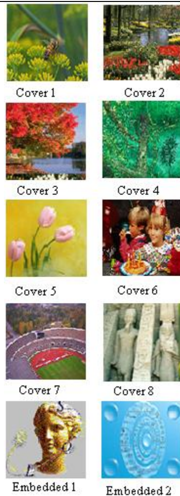
Fig. 1: The covers and secret images used in experiment

4.3 Determine the features for all images (covers, and embedded).