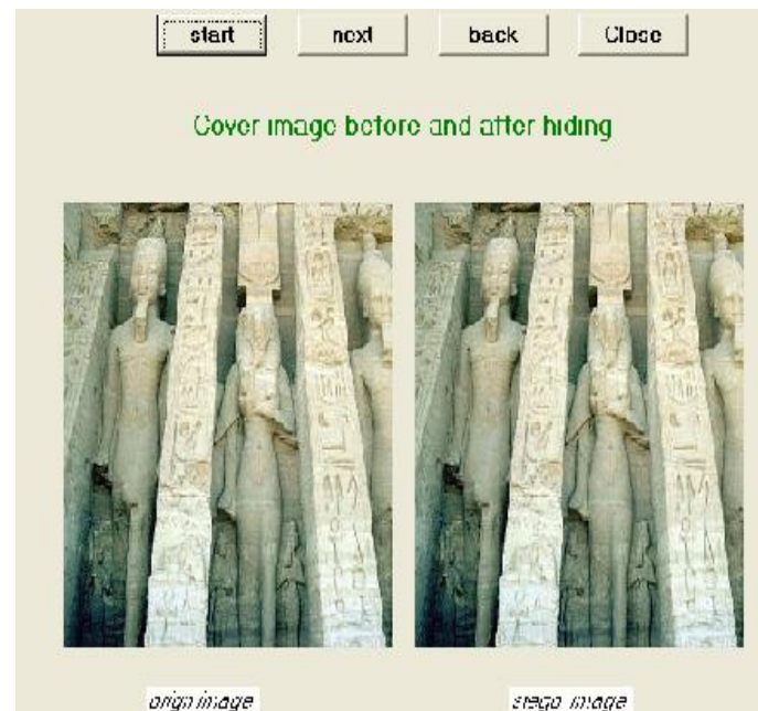
Fig. 5: comparing cover image before and after hiding embedded 1