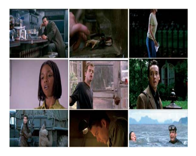
Figure 1: Images from dataset used for evaluation [5]

For the evaluation of both fuzzy based classification methods i.e. Fuzzy Inference systems and Modified Fuzzy C-Means Algorithm for skin detection, we used a standard dataset used Sigal in his work [5]. This dataset is available online for the research purposes and can be downloaded from the author's web page. The dataset contains the high quality scenes from the movies and has a variety of scenes including the images of people belonging to different ethnicity, images with variation in background, source of illumination and camera characteristics. The dataset contains the images with individuals as well as crowded images with occlusion and background cluttering.