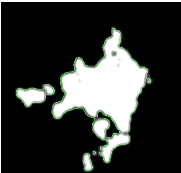
Fig. 4 Final contour of the village Ouahat Sidi Brahim