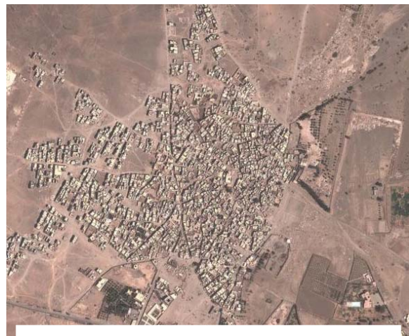
Fig. 1. Image of Ouahat Sidi Brahim from

We apply the method of GVF to each separate region in our image, taking the initial contour is a circle outline that surrounds this region, will evolve until it reaches the edge of the village as it is represented in Figure (4).