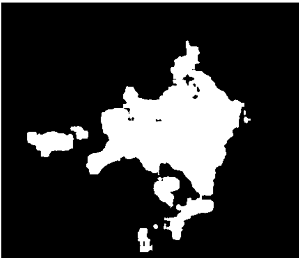
Fig. 3 Image after post treatment