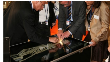
Fig 3. interactive touchscreen 3D autopsy table

Swedish researchers designed interactive touchscreen 3D autopsy table that allows pathologists to virtually check the actual body in details from multiple angles. Using the information provided by the scan of an actual body interactive touchscreen 3D autopsy table give this possibility to users to remove layers including the skin and the muscle or blood circulation system and zoom inside the body through cutting with a virtual knife.