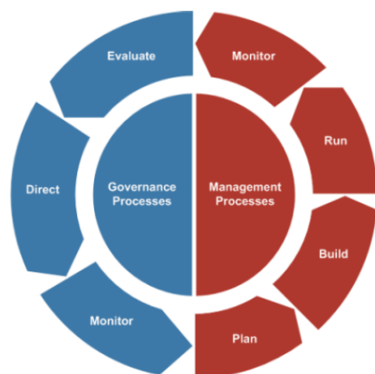
Fig.1 IT Governance vs IT Management

Governance is a responsibility of the board, while management is a responsibility of the executive management.