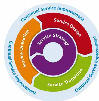
Fig.2 ITIL Lifecycle

The current version of ITIL (Version 3) provides a Service Lifecycle structure and is organized into five high-level core disciplines described in five core books [6]: