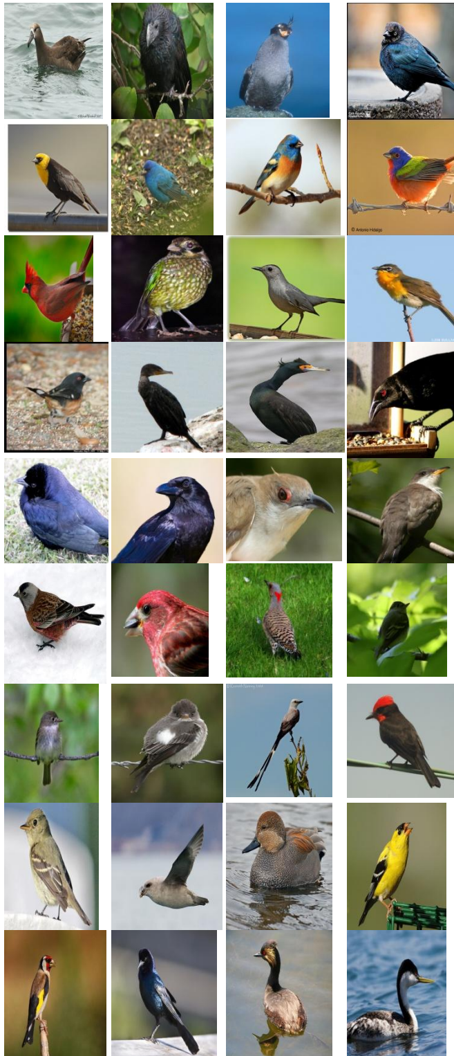
Fig. 1 Sample of WANG Image Database

of 200 bird species. In our experiments we choose 30 images for each the 200 bird species.