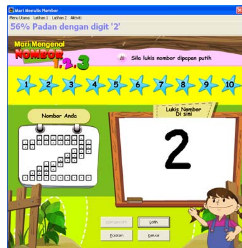
Fig. 2. The HLN's snapshot

Although Microsoft Visual Basic is good for developing the recognition engine, we encountered that one of its drawback is it cannot fulfill the type of interface that we want. It has limited functions that enable us to create the system which contains entertaining features as what the children want. Hence to make the user interface more attractive, we use Macromedia Flash MX. Macromedia Flash is well known software that enables its user to create a catchy animation. The user interface of the system is in the shockwave file format. By using the software we can create dozens of the graphical element, animation, audio recording and embedded it in into the system. Our user interface design theme for the handwriting recognition system is learning in an orchard playground. Fig. 2 shows the some screen snapshot of the HLN.