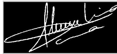
Fig. 2 Segmented and binarized signature