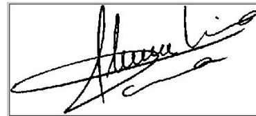
Fig. 1 Original Scanned Signature

Image pre-processing differs according to the genre that the image belongs to. The techniques used in this process may vary. There are 4 techniques that are used for signature recognition including: reading, displaying and resizing of the image, segmentation, binarization, fast fourier transform (FFT), enhancement and thinning