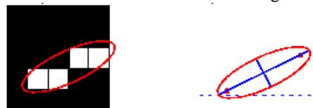
Fig. 4 The orientation detection

Orientation is acquired by applying the ratio of angle of major axis. The orientation of the signature can be found using the Matlab “regionprops” function, in which the angle between the x-axis and the major axis of the ellipse that has the same second-moments as the region.