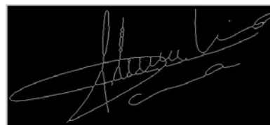
Fig.3 Thinned Signature