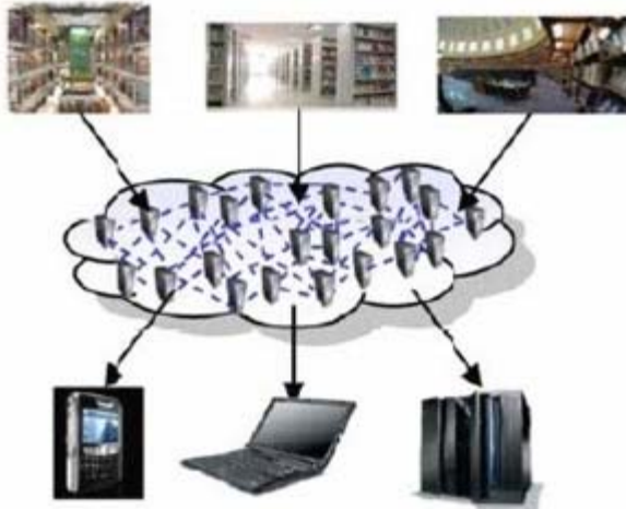
Fig. 3: Application of Cloud Computing in University Library

requirements frequently. And only in this way, they can master the basic demands of their users. And furthermore, library can develop itself according to such information and improve users' satisfaction. University library, as we all know, is famous for its academic and teaching influences. And IT technology has been the driving force of library development. What's more, librarians can keep using new technology to develop library and optimize library service. With the expansion of Cloud Computing application, this paper proposed to apply Cloud Computing in libraries. By establishing a public cloud among many university libraries, it not only can conserve library resources but also can improve its user satisfaction. And it can be illustrated in figure 3.