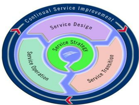
Fig. 1 the service lifecycle.

The five core books cover each stage of the service lifecycle (Figure 1), from the initial definition and analysis of business requirements in service strategy and service design, through migration into the live environment within service transition, to live operation and improvement within service operation and continual service improvement.