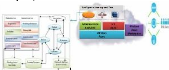
Fig 2. The proposal architecture based on the Windows Azure platform

·Services: use intelligent virtual learning community given by the provider.