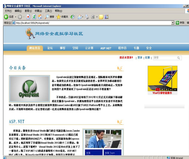
Fig 5. System prototype

Windows Azure and .NET Services require different invitation tokens, as you move towards cloud computing, workflow provides a simplified approach for coordinating complex service interactions in the composite cloud solutions you build. The .NET Workflow Service provides a scalable hosting environment for running and managing WF workflows in the cloud. Because the hosting environment is built on Window Azure, it's capable of scaling on demand, and because the WF runtime is being used, workflow instances are not pinned to any particular server-they are free to move from one server to another for each episode of execution. The .NET Workflow Service relies on a WF persistence service that leverages Microsoft SQL Services to save the state of running workflows and to ensure recovery capabilities, you build workflows for the cloud using Visual Studio and the same workflow designer that you've always use. You ultimately create XAML workflows and rules file. These XML files are then deployed to the .NET Workflow Service where they can be sued to create workflow instances. Based on the use of the core technology, a system prototype is implemented (shown in Fig 5).