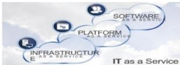
Fig 1. Cloud Computing