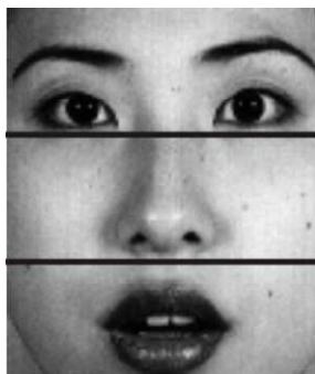
Fig. 2 Average face divided into three blocks

It is observed that facial features contributing to facial expressions mainly lie in some regions, such as eye area and mouth area and nose area. Facial classification needs information that is more useful. These regions contain such type of information. The important features of expressions reflected through the eyes and mouth. Therefore, we extract average face of size 125 x 106 from original image. Again, the average images divided in to three blocks to extract the more features such as upper, middle and lower as shown in Fig 2.