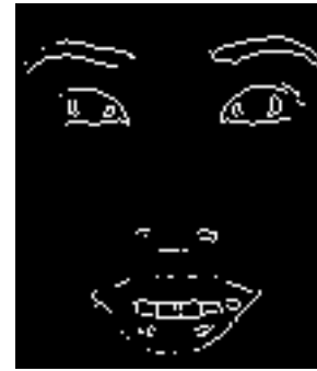
Fig. 3 Image after applying Sobel edge detection operator

We have decided to extract the features from edges and boundaries of images. For extracting the edges we have used Sobel edge detection operator. Fig. 3 shows the image after applying Sobel edge detection operator.