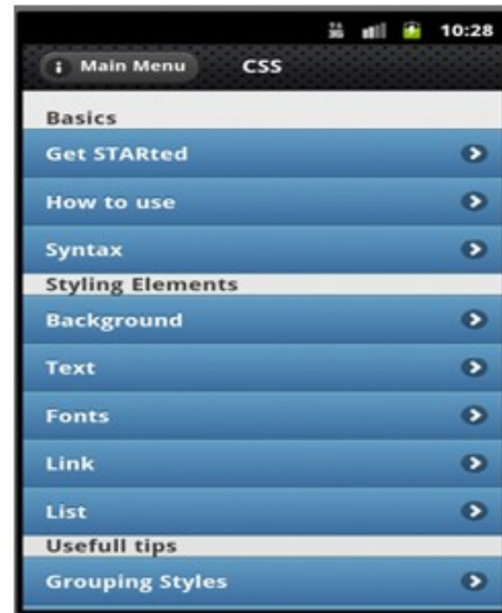
Figure 2 List of topics

Each topic consists of subtopics with explanations, pictures, examples and other things as in figure 2. You can scroll them. Choose the one you like by clicking over it figure 3.