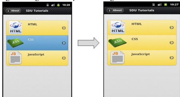
Figure 1 Main menu of application

In main menu you can select one of Web Programming Course topics as in figure 1.